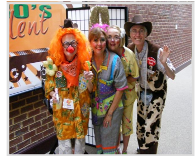
Freckles the Clown and friends!